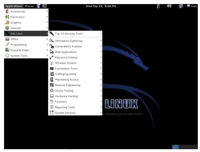
Fig. 3. Kali Linux integrated tools

Kali Linux is preinstalled with a great many popular penetration testing tools, including: Nmap (port scanner),